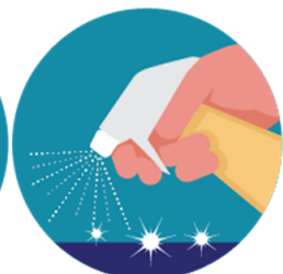
CLEAN AND DISINFECT