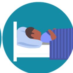
STAY HOME WHEN SICK